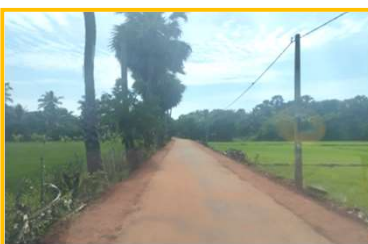
Construction of sornapuri puliyankulam Road - Memo stage - II