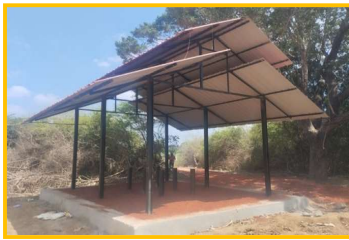
Construction of Burning Center & Access Road at Keerisuddan Cemetary