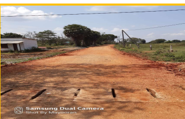
Renovation of Thambai Sankaththady Road