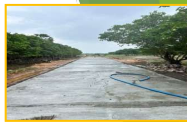
Construction of Seddiartharaiveli Main Beach Road, Pallikuda