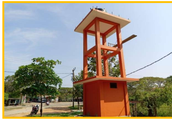
Provision of Water Supply Facilities for Bus Stand & Public Market at Nanattan