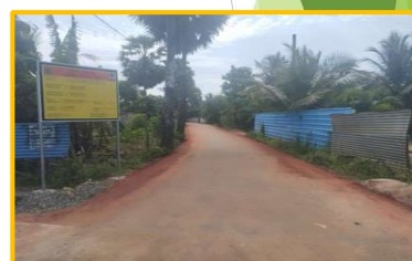
Construction of sornapuri puliyankulam Road - Memo