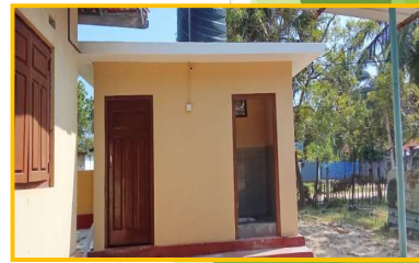
Construction of Toilet Facilities at Thalaimannar Library