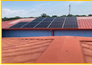
Supplying & Installation of Rooftop Solar System at Iluppakkadavai Sub Office Building