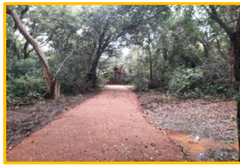
Construction of Burning Hut at Periyakulam Cemetry