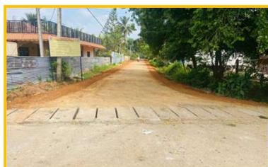
Renovation of Putharekkuda Road (Barathi Home Road)