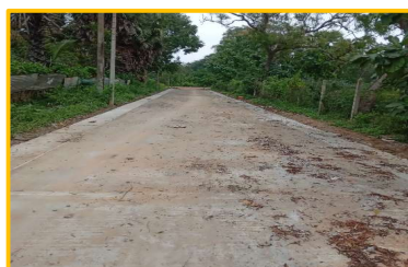
Construction of 5th Road (Kanakapuram Road-GS Road)