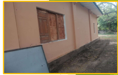
Renovation of Library at Mandaitheevu