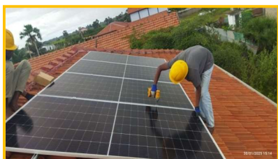
Supplying & Installation of Rooftop Solar System at Chilawathurai Library Building