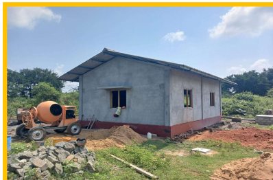
Construction of Slaughter House at Dumping Ground at Kalvilan